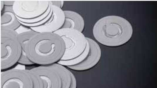
苹果皮垫片 Apple Foil Sealt