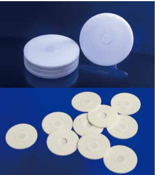
发泡透气垫片 Foam Foil Sealt